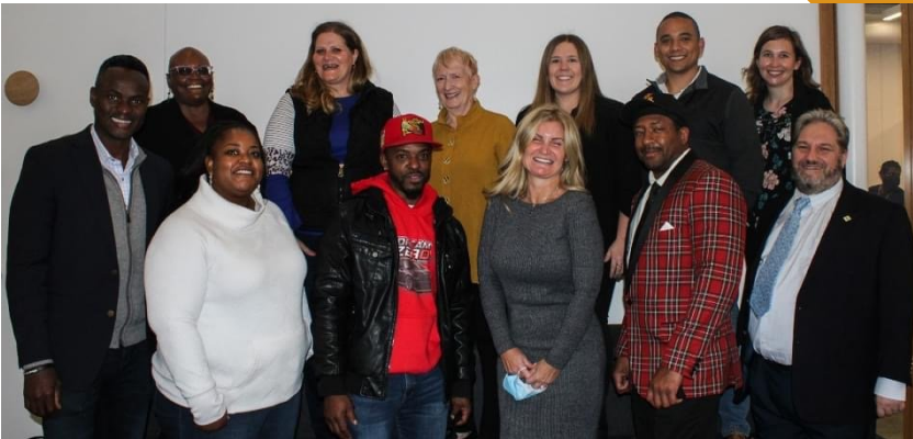
Spark Developer Academy