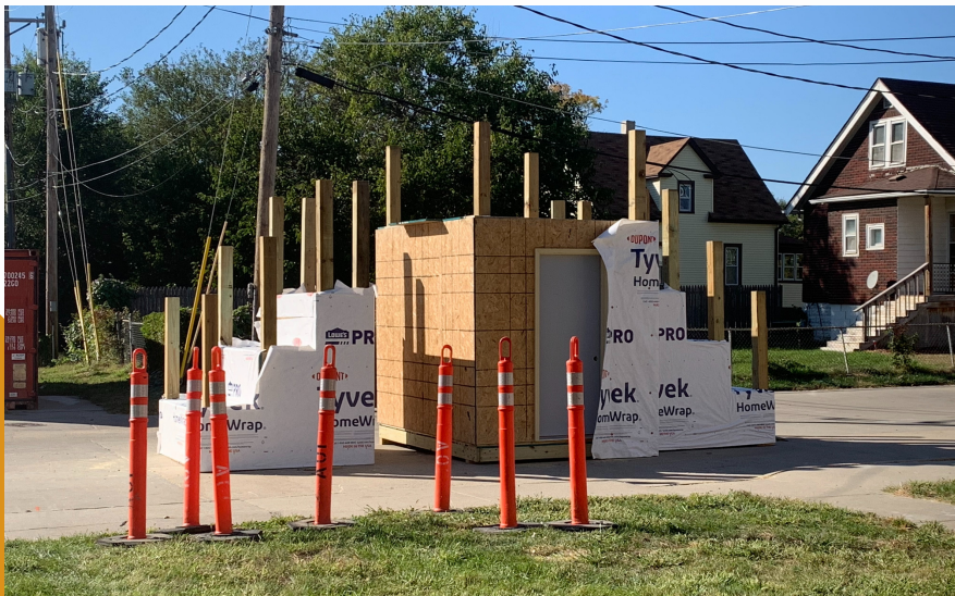
Seed Archive (work in progress) 2514 N. 24th Street.

Spark has also been awarded a Community Challenge grant from AARP to create a seed archive behind the Fabric Lab (2514 N. 24th Street) and create an interactive public space. With the help of habitat for humanity, Volunteers, and artists the construction of the seed archive is nearly complete! Learn more at the seeds are currency event on November 13th at 1pm.