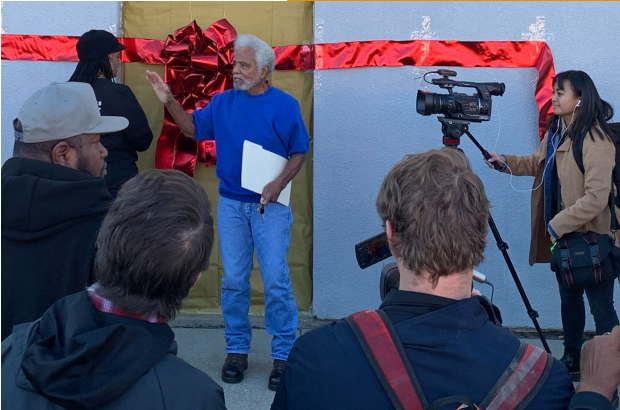
Ernie Chambers Street & Museum Dedication