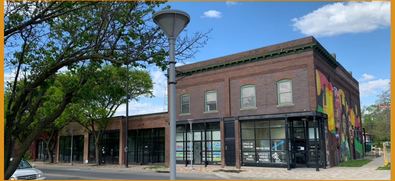
The Fabric Bays 2514-2522 N. 24th Street.