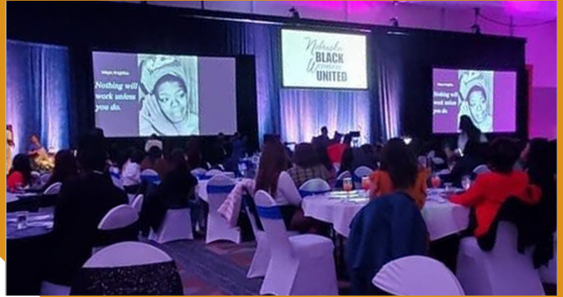
Black Women United, Financing Your Future, 400 in attendance