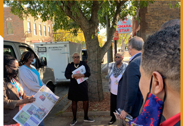
Neighborhood Action & Fact Historic Tour