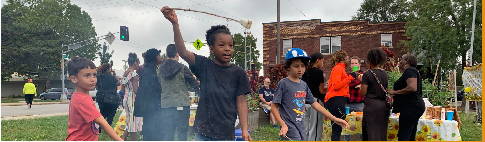
Healing Roots Garden's Harvest Festival